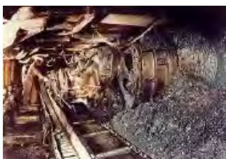
Underground dust suppression