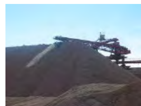
Stockpile dust control

CAPABLE OF REDUCING WATER SURFACE TENSION BY MORE THAN 80% AT RATIOS OF UP TO 1:4000